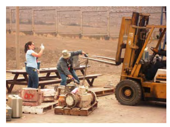
Figure 4. Removal of disused sealed sources.