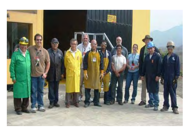
Figure 2. IPEN and LANL working groups.