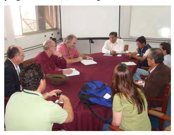
Figure 1. Coordinated work between IPEN and LANL teams.

As part of the joint work plan, a pre-work meeting was conducted to ensure both teams understood the safety and technical aspects of the work to be conducted. Also, daily meetings were held in order to discuss the work expected to be completed during that day and review previously conducted work to see what improvements could be made to prepare for activities. Both technical teams developed activities according to the joint program needs (1). See Figures 1 and 2.