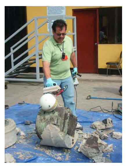
Figure 3. Measurement of dose-rate.